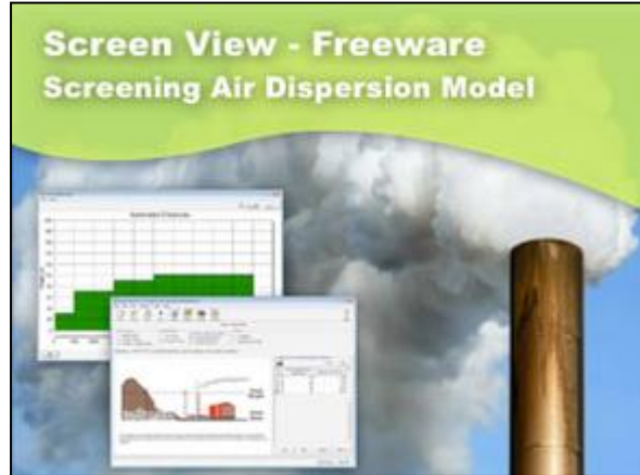
US EPA SCREEN3 Model